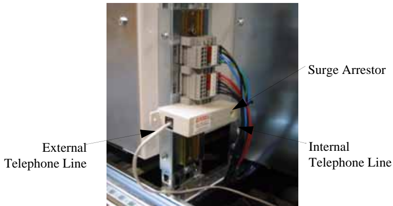
Figure 5 Telephone Cable Routing