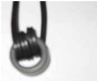
Figure 3 DC Cord Looped Through Toroid