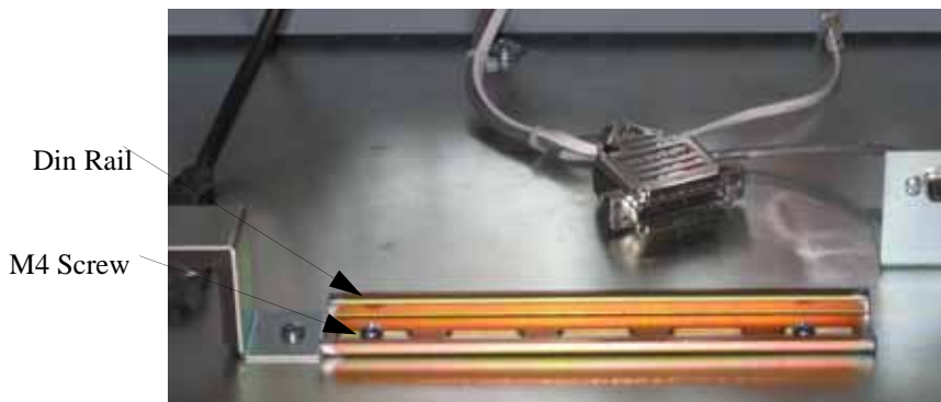
Figure 1 Installing the DIN Rail to the GT100E